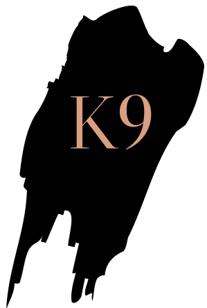
2. KRS 260 m 2